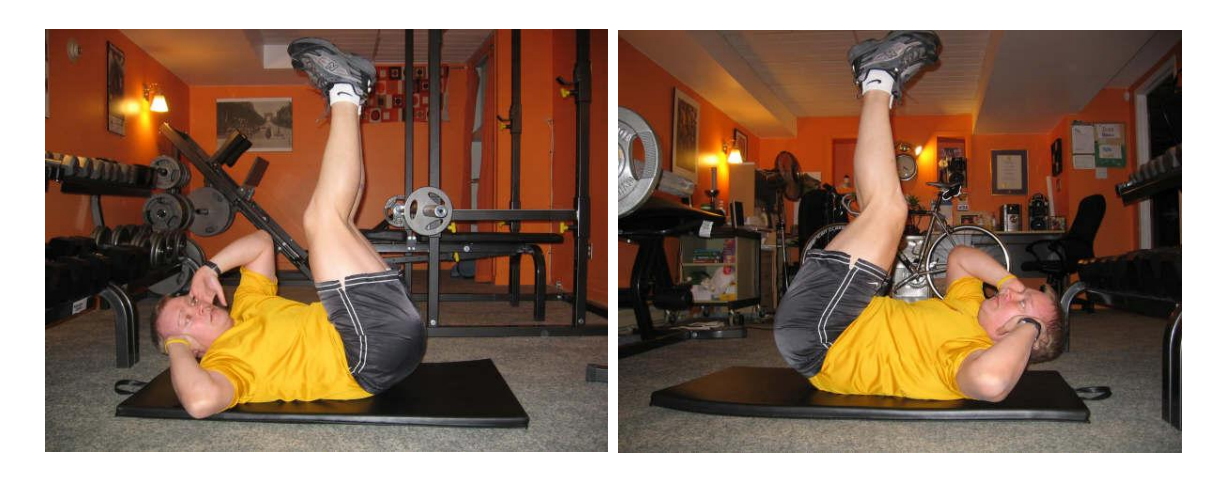
V Sits 2 sets 8-10 Superset with Cross Over Crunch

Crossover Crunch 2 sets 12 each side. Superset with V Sit